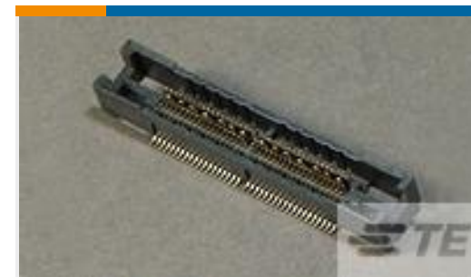
TE Part # 5767181-2 MICT,RECEPT,76,ASSY,PDNI