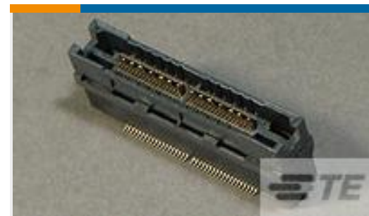
TE Part # 5767154-2 76 POS. .355 VERTICAL RECEPTACLE