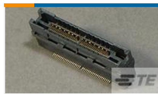
TE Part # 5767146-2 TAPE AND REEL PACKAGED MICTOR