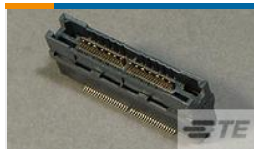
TE Part # 5767153-9 72 POS. .355 VERTICAL RECEPTACLE