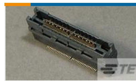
TE Part # 5767146-9 TAPE AND REEL PACKAGED RECEPTACLE