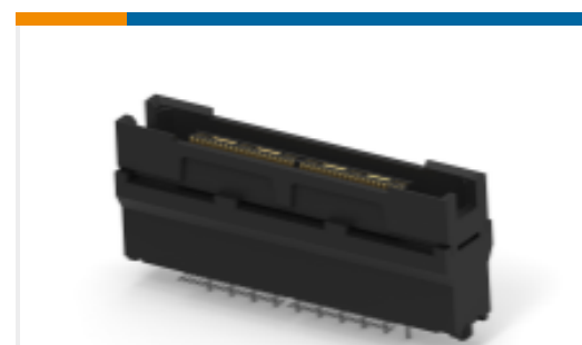
TE Part # 5767145-2 MICTOR RECEPTACLE ASSY, .355 V