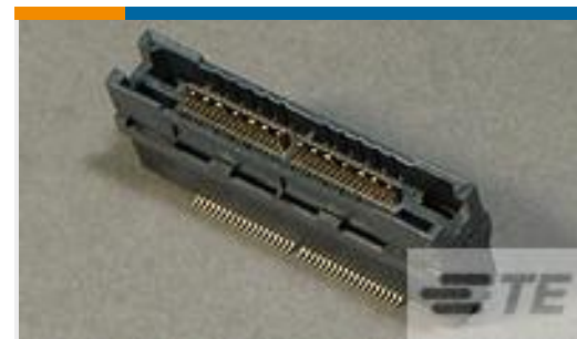
TE Part # 5767178-2 MICTOR .355 RECEPTACLE, 76 POS T&R PACKAGE