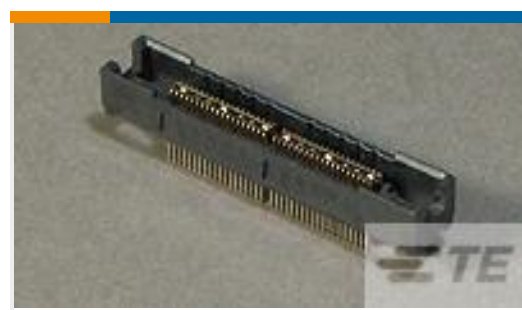
TE Part # 5767143-2 MICT,R/A,RCPT,076,ASY,062,30AU